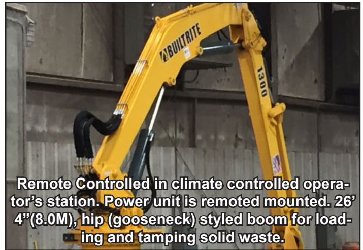
Remote Controlled in climate controlled operator's station. Power unit is remotely mounted. 26'4" (8.0M), hip (gooseneck) styled boom for loading and tamping solid waste.