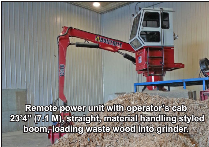
Remote power unit with operator's cab 23'4" (7.1 M), straight, material handling styled boom, loading waste wood into grinder.

Builtrite™, Stationary Electric Material Handlers have proven themselves in a number of waste and scrap handling applications, capable of handling a wide variety of materials. With a wide array of options, boom configurations and attachments available, let Builtrite design a material handler to maximize production at your facility. Stationary Electric Material Handlers are much less expensive to operate, safer, quieter and don't produce emissions like diesel powered, mobile equipment. Maintenance costs are also less and the power unit can be remotely located where it is not subjected to dusty conditions, further reducing maintenance costs.