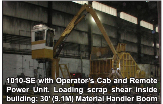
1010-SE with Operator's Cab and Remote Power Unit. Loading scrap shear inside building; 30' (9.1M) Material Handler Boom